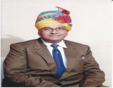
Former VC Singhania university, Rajasthan [04:55-05:15]